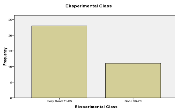
Fig 1. completeness of the learning outcomes of the experimental class